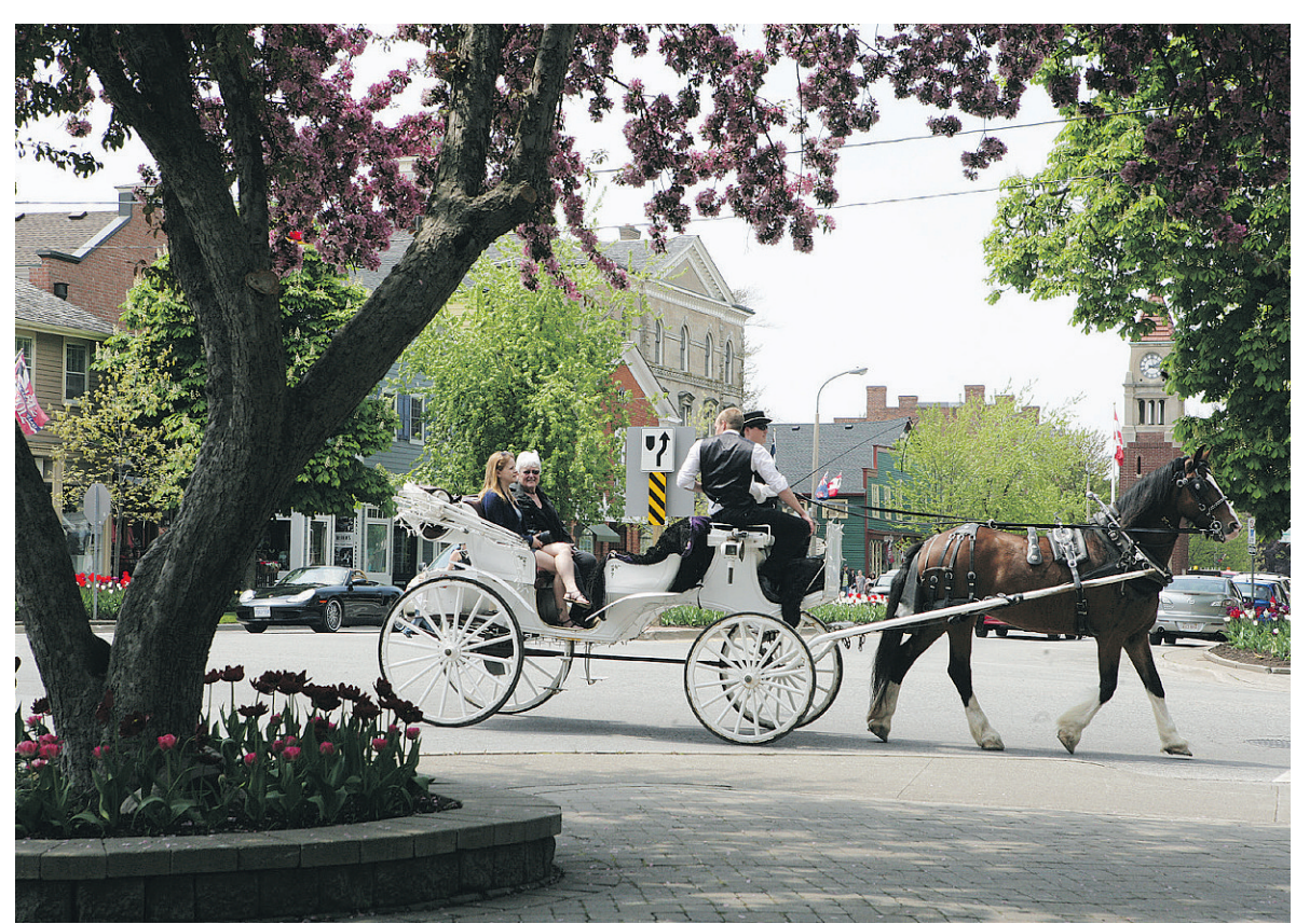
A clock tower and a horse-drawn carriage are among the reasons Queen Street in Niagara-on-the-Lake is regarded as historic and charming.

Here's a sprinkling: The season opener will be Peter and the Starcatcher (a prequel to Peter Pan, April 8 to Nov. 1) and other hot tickets include Sweet Charity (by Neil Simon, original staging by Bob Fosse, April 17 to Oct. 31); Pygmalion (by Shaw, May 31 to